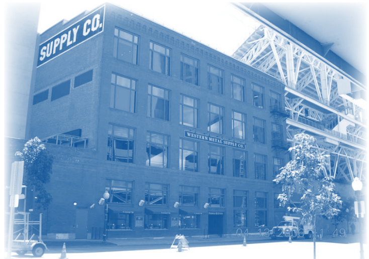
Western Metal Supply Co. Building

Today, skyscraper hotels and condominiums, office buildings, parking structures, shops and restaurants have replaced the old industrial warehouse district. This new redeveloped and revitalized district known as East Village is the location of PETCO Park, which is home to the Padres, San Diego's baseball team. With the Padres commitment to preservation of historic resources, this 100 year old historical brick building was preserved and adaptively re-used. The Western Metal Supply Co. Building is an integral part of PETCO Park. The building is incorporated into the ballpark, with the left-field foul pole attached to its southeastern corner. It houses the Padres Majestic Team Store; a souvenir shop on the ground level; party suites on the second and third floors; a public restaurant on the fourth floor, and seating areas and bleachers on the rooftop.